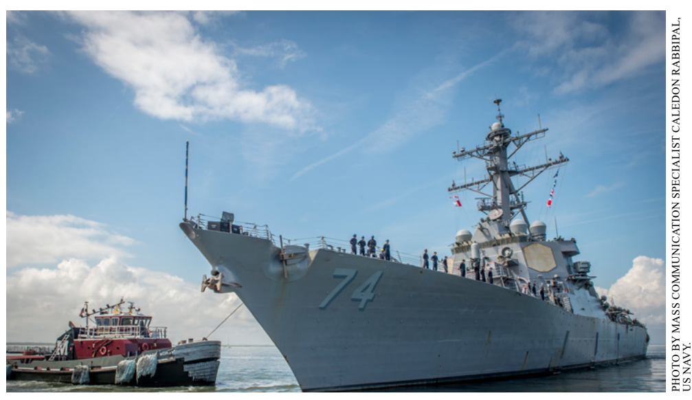
Naval Station Norfolk evacuating ships in preparation for Hurricane Florence in September of 2018.

Identifying an installation's highest exposures informs the identification of strategies to mitigate those vulnerabilities.