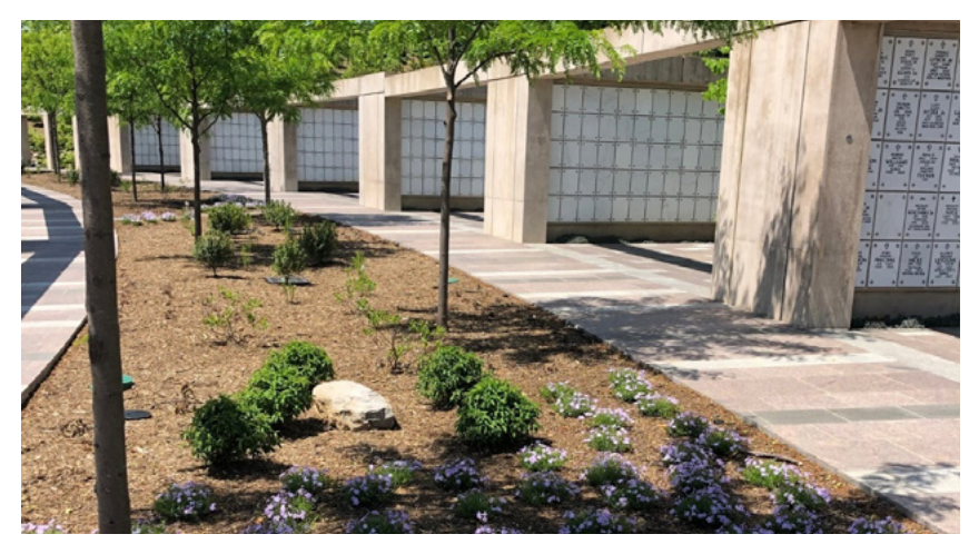
Figure 3: Phlox subulata offers a colorful groundcover.