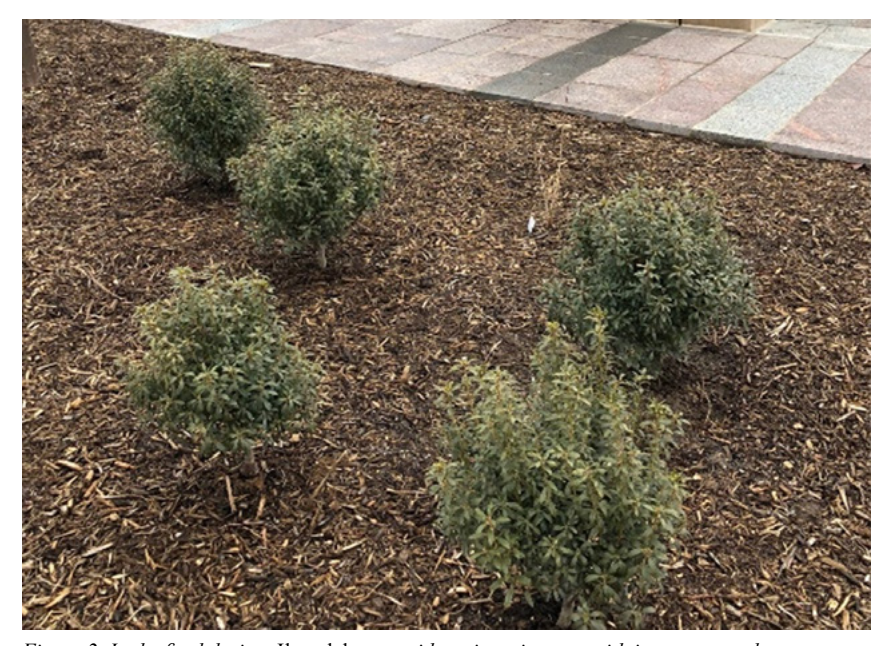
Figure 2: In the final design, Ilex glabra provides winter interest with its evergreen leaves.