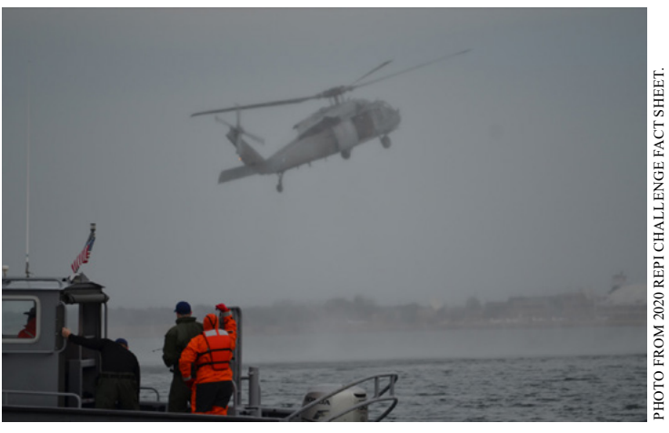
Search and rescue training at 2020 REPI Challenge award winning installation, NAS Patuxent River (MD).

The MIS program is designed to provide technical and financial assistance to states and local governments to analyze and identify actions necessary to protect and enhance military sustainability. MIS grantees work with installations through the Office of Local Defense Community Cooperation (OLDCC) to identify encroachment, compatibility and resiliency challenges, and areas of potential conflict. CUPs are developed to identify collaborative strategies and priorities to implement recommended actions to alleviate and prevent incompatible development and/or installation resiliency issues likely to impair the continued operational utility of a DoD installation, range, special use air space operation, or training area.