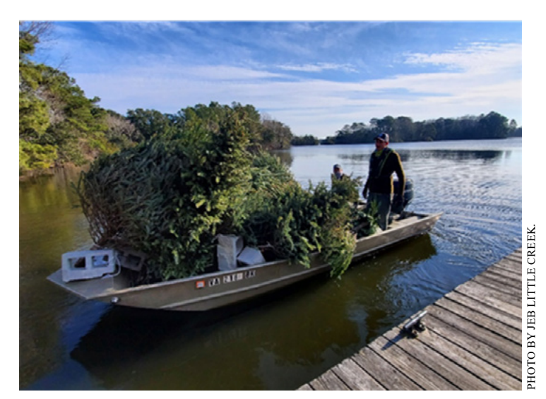
Image here and at the bottom of the page show volunteers participating in submerged Christmas tree placement at Lake Bradford on JEB Little Creek.