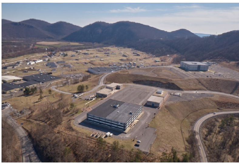
Aerial image of ABL in West Virginia.

Remediation of several sites at ABL is required by law under the Comprehensive Environmental Response, Compensation, and Liability Act (CERCLA). Soil and